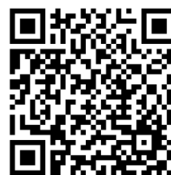
WICASA Newsletter - May 2023