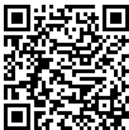
The Chartered Accountant Student Newsletter - May 2023