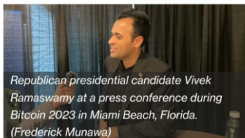
Republican presidential candidate Vivek Ramaswamy at a press conference during Bitcoin 2023 in Miami Beach, Florida. (Frederick Munawa)

Bitcoin has suddenly found itself at the center of campaign trash-talking and chest-thumping ahead of the 2024 U.S. presidential election.