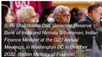
(L-R) Shaktikanta Das, Governor, Reserve Bank of India and Nirmala Sitharaman, Indian Finance Minister at the G20 Annual Meetings, in Washington DC in October 2022.

India's government and central bank have received proposals asking to restore access of the Unified Payments Interface (UPI), a widely popular real-time payment system,