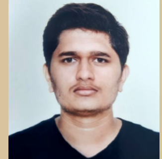
CA Final Student

Lastly, voting is not just a right granted to us by constitution but also a right to make things better for us which will bring change in this country. Therefore it is very important for all the eligible voters to cast their votes and actively participate in the electoral process and to shape a better future for themselves and generations to come.