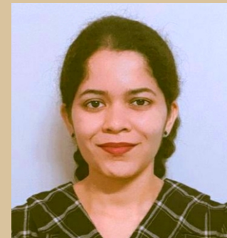
CA Final Student

I am enthusiastic about expanding my skill set and further refining my understanding of auditing, taxation, and financial reporting. Moreover, I am eager to deepen my knowledge of industry-specific nuances, regulatory requirements, and emerging trends that will shape the future of my profession.