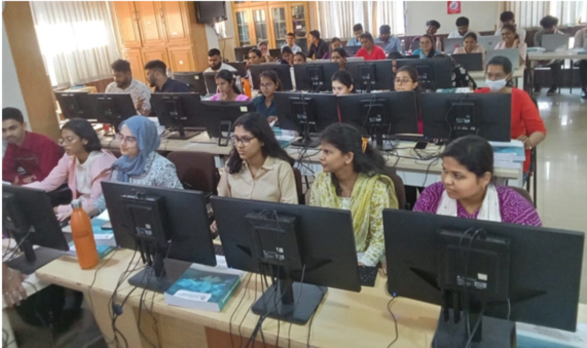
Interactive Meeting with Newly Qualified Chartered Accountants who cleared November 2024 Final Examinations held on 16th February 2025