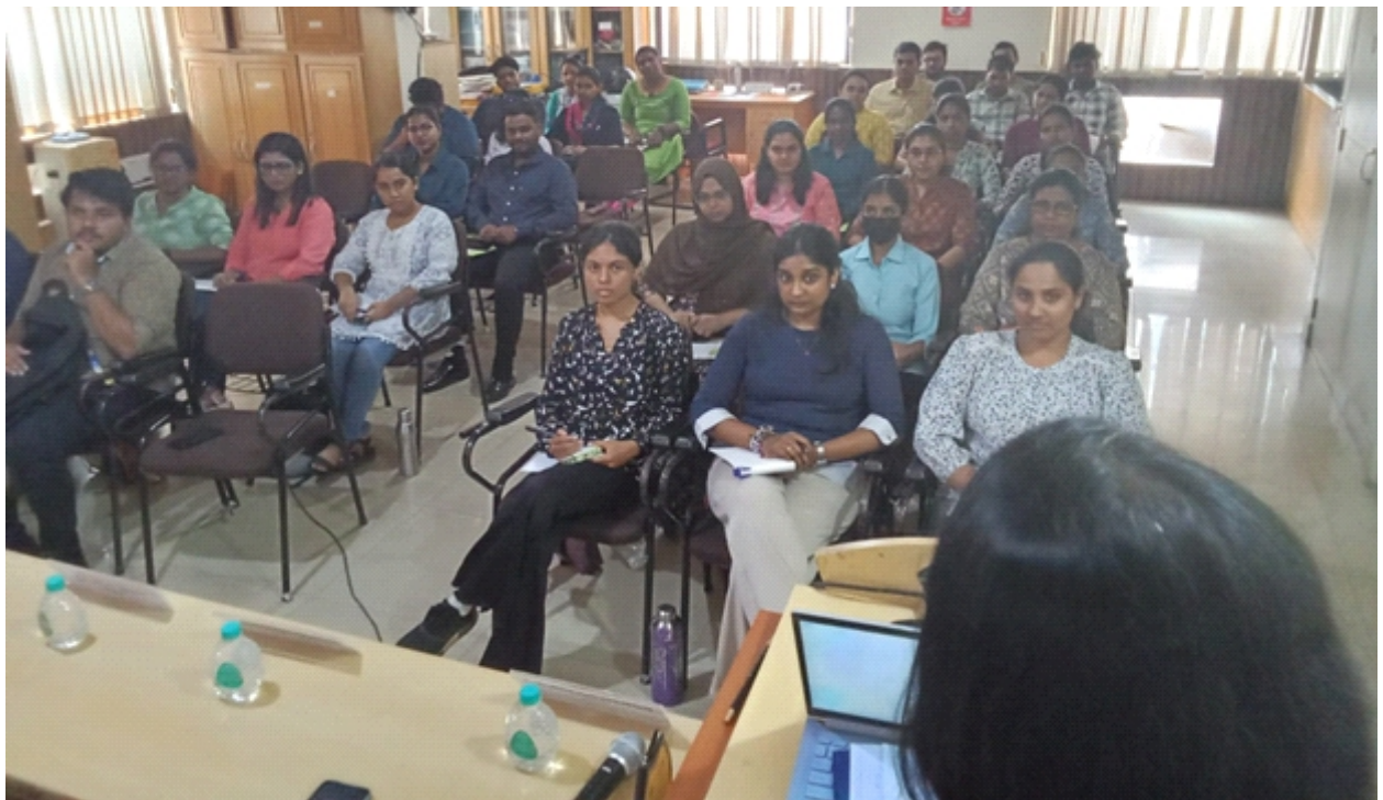
Career Counselling Programme & Tax & Financial Awareness Programme held on 28th March 2025